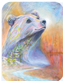
Watchful One — Shelley Enemark

Please enjoy the following small selection, and learn more about these talented artists.