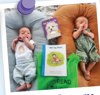
Child Life Programs like book bags for children and bubble tubes