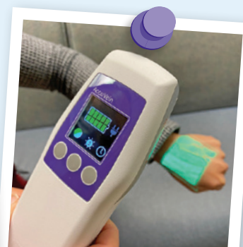
Equipment like vein finders, laryngoscopes, and microscopes