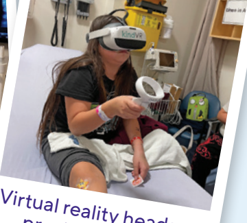
Virtual reality headsets provide kids with comfort and distraction