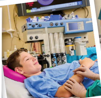
Specialized surgical equipment