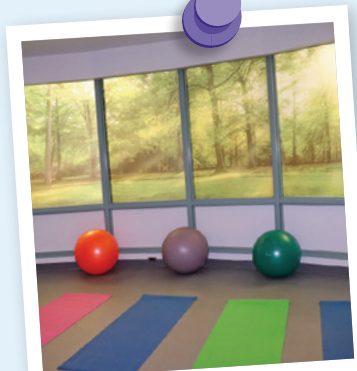
Indoor play space naming and opening

Thank you for your support in 2024! Your present has changed their future by transforming child health care and research. You helped purchase specialized medical equipment crucial for the care of our youngest patients, funded Child Life programming that comforts sick kids and families while in hospital, and fueled leading-edge research at the Children's Hospital Research Institute of Manitoba (CHRIM).