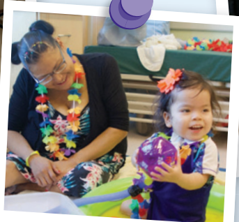
PSCU Child Life Programming