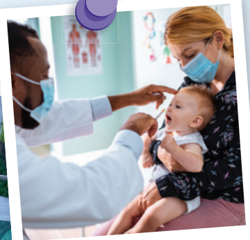
Research in action