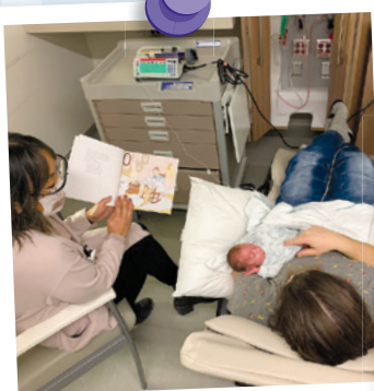
Reading to NICU babies

Thank you for your support in 2022. You made it possible to purchase life-saving equipment, support Child Life programs to help kids be kids while in hospital, increase research to improve the lives of children and complete important projects like an outdoor play space for our child and youth mental health program.