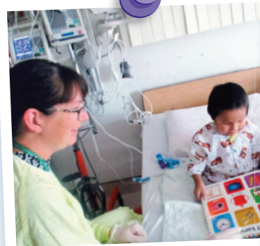
books for kids