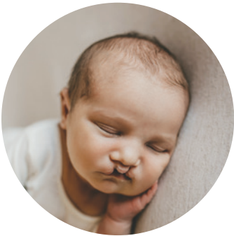
Baby Beau with cleft palate

Every parent whose child has undergone surgery knows that the hardest moment is leaving your child at the operating room door.