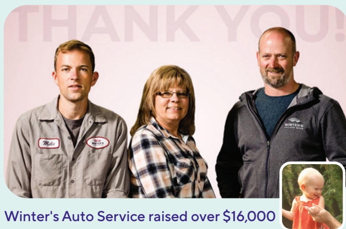
Winter's Auto Service raised over $16,000

Paige's parents have shared her story to encourage others to support the Children's Hospital.