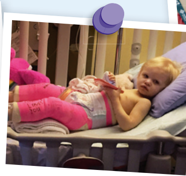
remote monitored beds